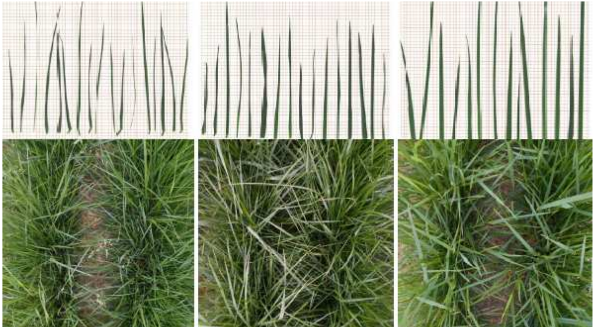
1 very fine foliage